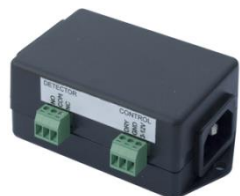
PowerEgg 600 237