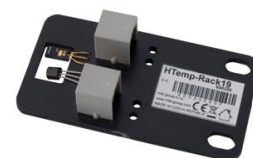
HTemp-Rack19 600 330