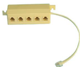
Poseidon T-Box 600 040