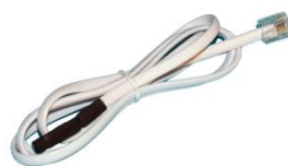
Temp-1Wire 1m 600 242