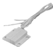
Door Contact 600 119